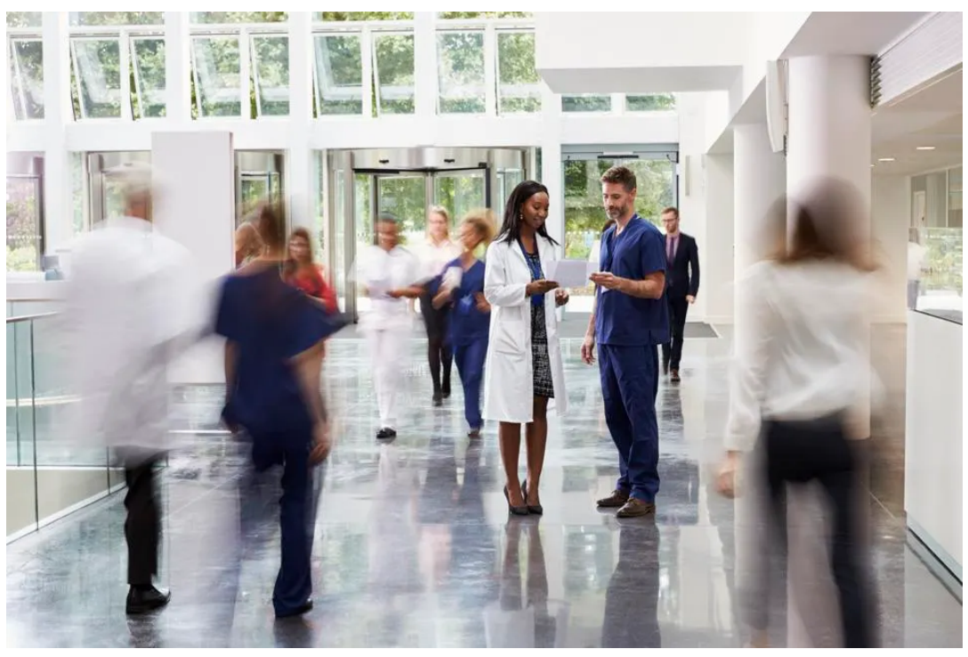
Your annual travel insurance policy may have some restrictions, particularly when it comes to ... [+]

I have details on how to buy the best policy in my free guide to travel insurance.