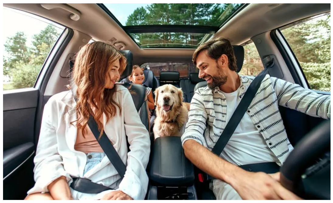
Just as travel has changed since the pandemic, so also has annual travel insurance.

An annual travel insurance policy has other benefits. For example, if you like to travel at the spur of the moment, a multi-trip policy might be ideal for you. There's no need to call a travel insurance company before you leave — you're already covered. And, of course, an annual policy is much less expensive than buying standalone policies for multiple trips per year, although your coverage is more limited.