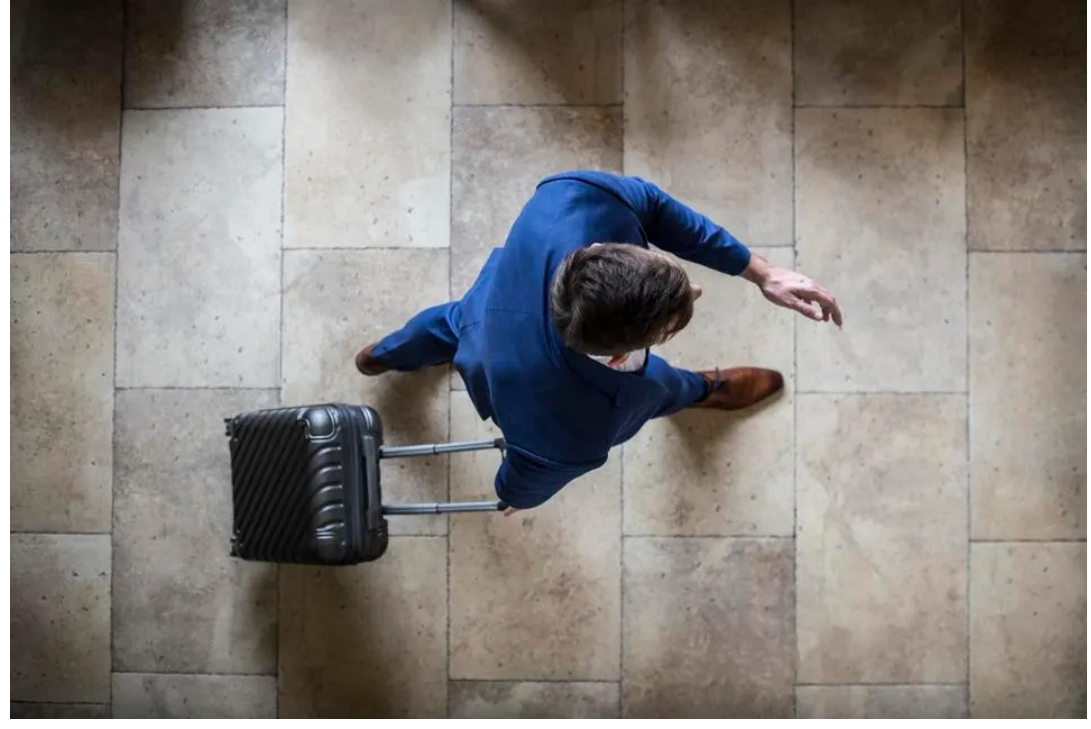
Corporate travelers can benefit from an annual travel insurance policy.

Annual policies are priced according to the coverage limit. Your options are typically $2,500, $5,000, $7,500 or $10,000 per year in claims. The average cost of an annual policy that insures $10,000 in trip costs is around $450. Arch RoamRight, for example, has plans that starting at $192 per year.