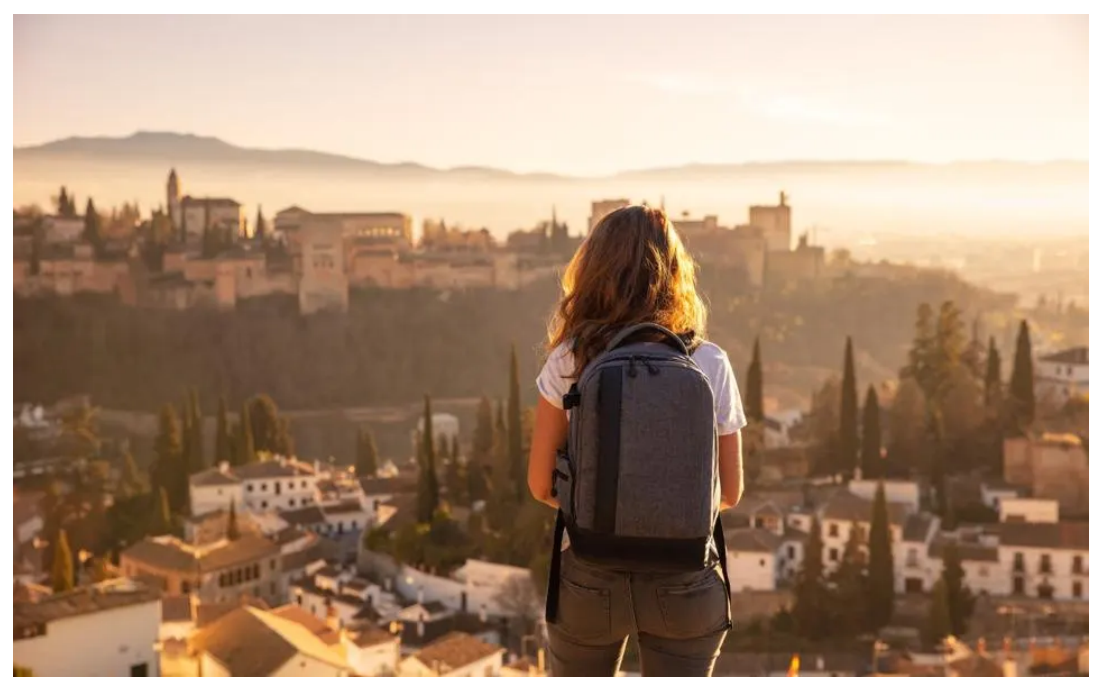
Here's how the pros buy annual travel insurance.

In short, while the basic framework of annual travel insurance hasn't shifted much since before the pandemic, there are a lot of smaller changes under the hood.